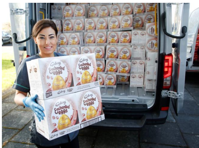
A frontline nurse - celebrating Easter thanks to Feed the Heroes!

The support for the Feed the Heroes campaign is still strong - over one million euros has been raised to provide meals for the people who have been putting their own lives and health at risk over the last six weeks to offer support to patients suffering from COVID-19. You can read the FTH blog to find out how the frontline workers have to protect themselves while working and the difference the donations have made!